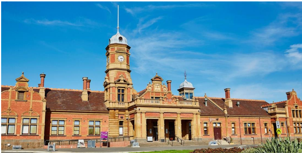
The magnificent and historic Maryborough Railway Station

The Tour won't be visiting all of those regional centres, as there won't be time, but it will visit places like Heathcote, Dunolly, Harcourt or Maldon and maybe take a run up Mt Alexander and/or Mt Tarrengower to take in the views.