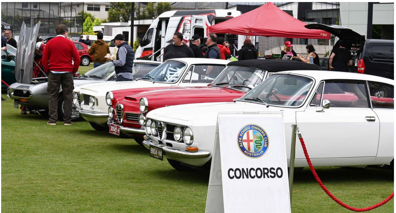
AROCA Victoria's Spettacolo Concorso 2022

Please send an email to concorso@AlfaClubVic.org.au (include your mobile number) to learn more about this great Alfa Club Vic role.