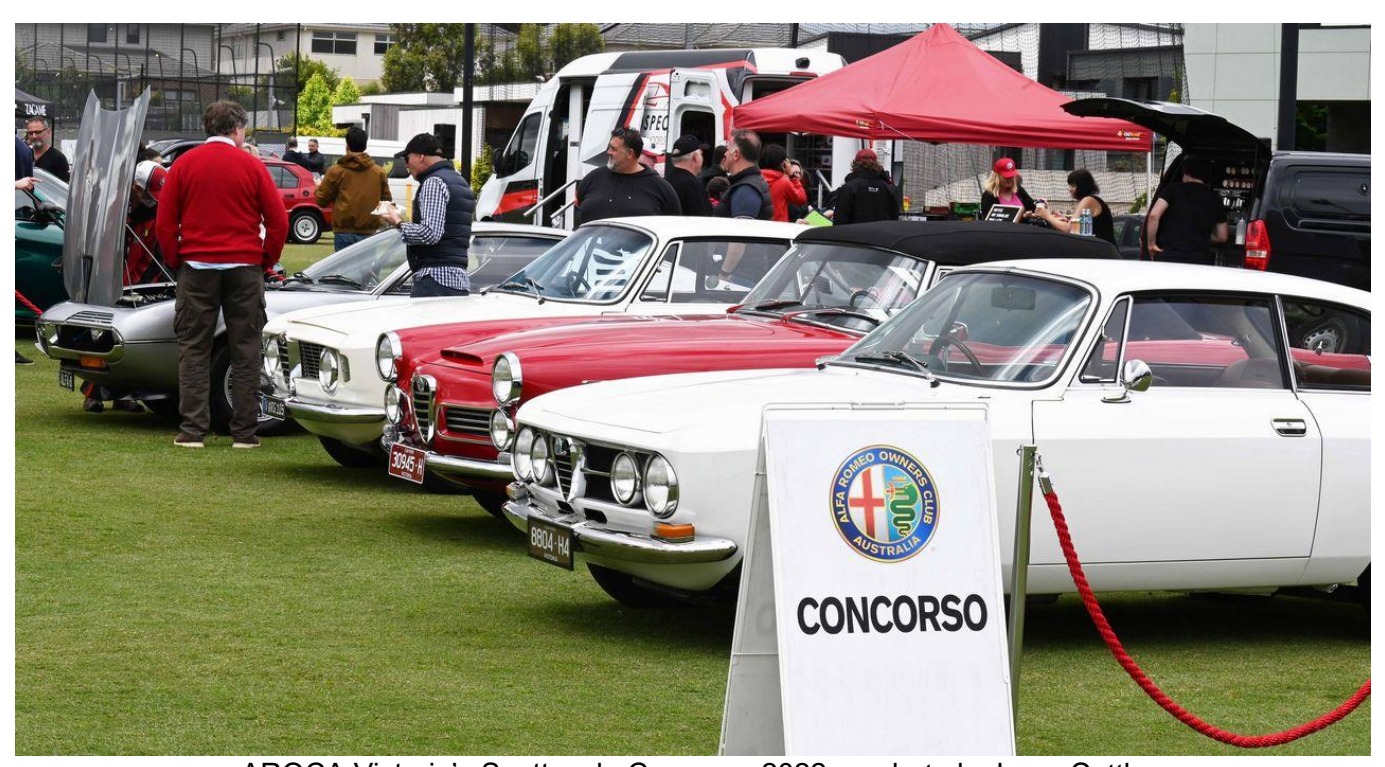
AROCA Victoria's Spettacolo Concorso 2022

Please send an email to <a href="mailto:concorso@AlfaClubVic.org.au">concorso@AlfaClubVic.org.au</a> (include your mobile number) to learn more about this great Alfa Club Vic role.